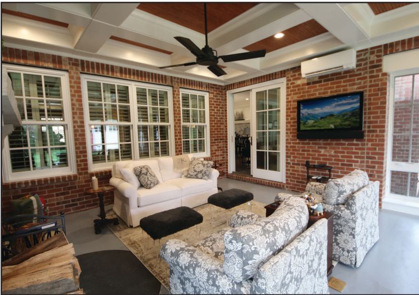
Furnished with comfy couches, fireplace, and television, all safe from the outdoors