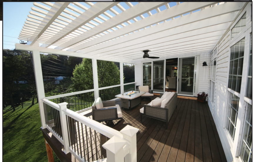
White Pergola shelters Gorgeous Deck

It is hard to convey just how much one room can transform the way a family functions, yet this daring new space definitely makes a statement to all. Friends and family are certainly welcome here!