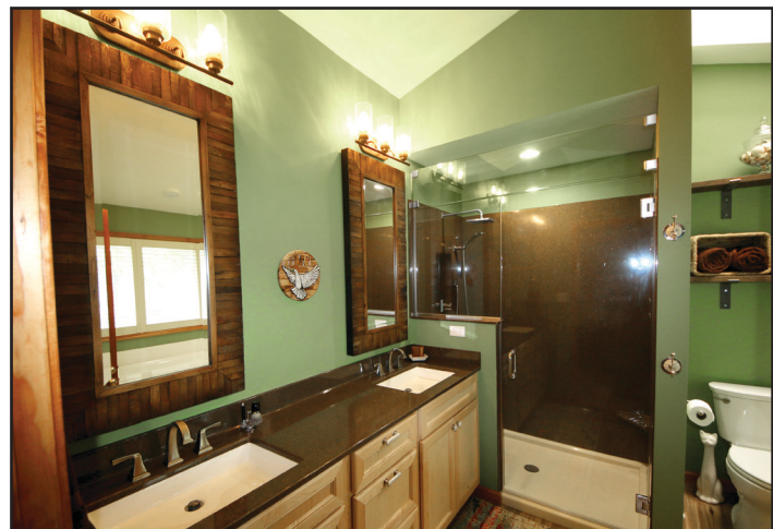
Contemporary Master Bath Accented with Bold Decor