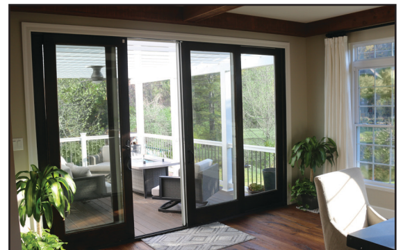
Sliding Rear Entry Doors let the outside in