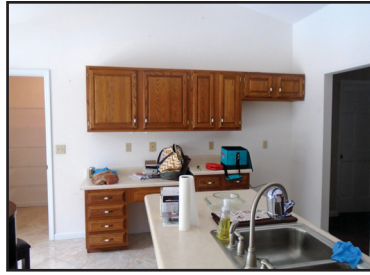
Glencoe Kitchen Remodel