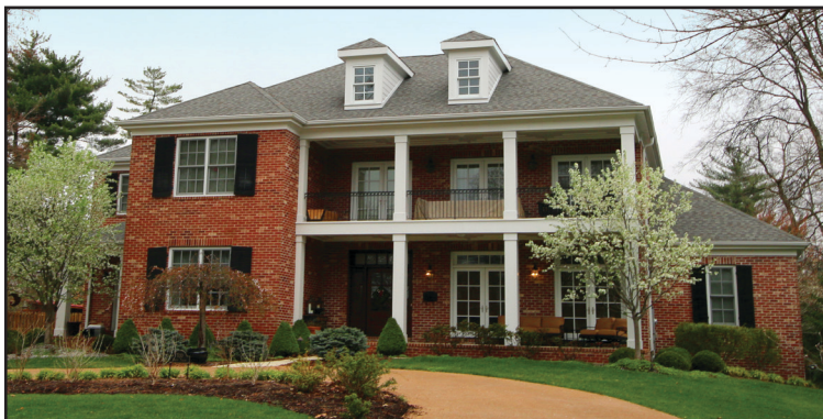
Original Front Elevation in the Georgian Revival Style