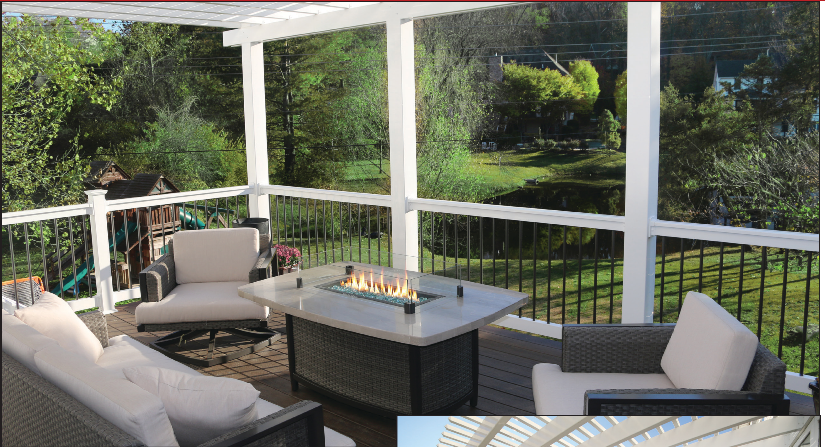
Casual Rattan Seating surrounding Elegant Gas-Powered Fire