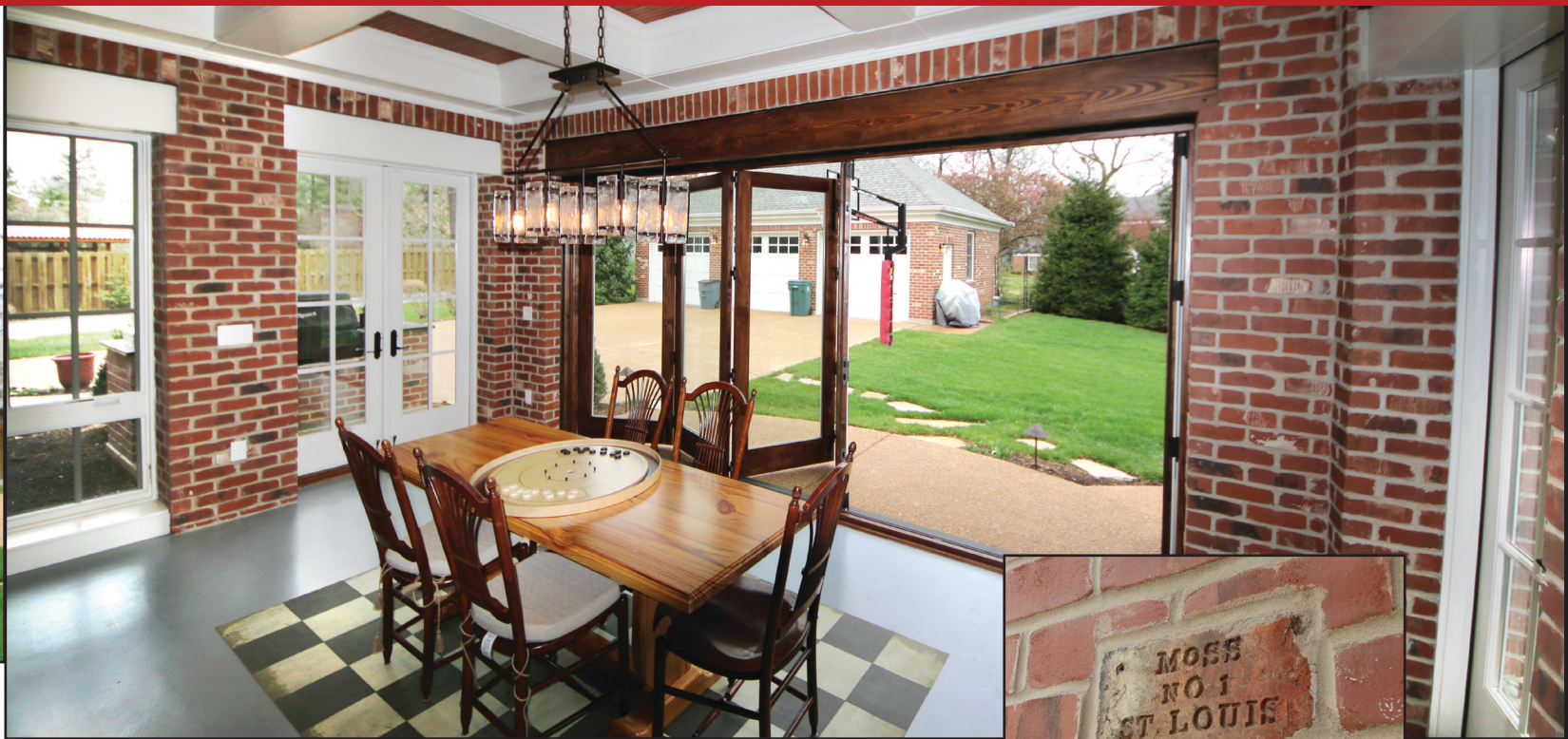
Innovative Nana Doors by Weiland fold in and disappear to fully open the room to the outdoors

To protect from the natural elements while still letting inviting breezes in, a motorized screen can now be lowered to cover the entire rear opening with the push of a button. To hide the motor and components necessary to the screen, Laurie also designed a detailed wooden header that blends in seamlessly.