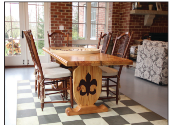
Hand-crafted Custom Table