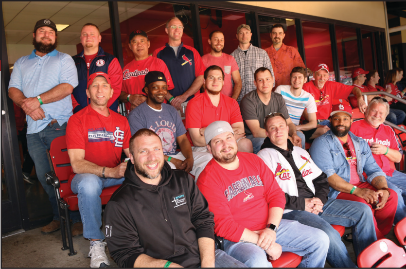
Agape's Field Team enjoys time together at the Cardinals Game