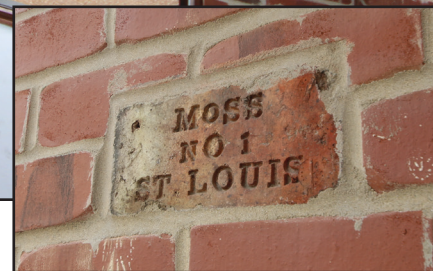
Inlaid Antique Brick provides Old World Charm

This project was a Kirkwood Favorite Building Awards nominee in 2017.