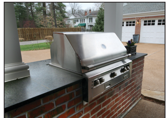
Built-In Outdoor Grill

Celebrating 33 years of making our clients' dreams a reality.