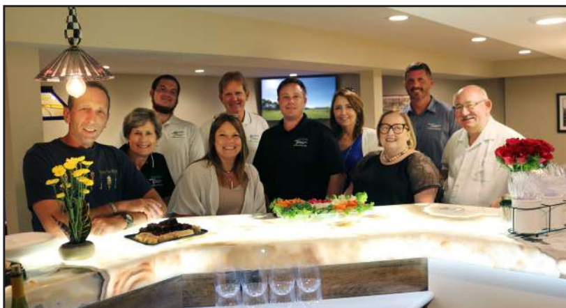
To show appreciation, the Proud Homeowners hosted a party for the Agape Team

View our online portfolio at www.AgapeConstruction.com