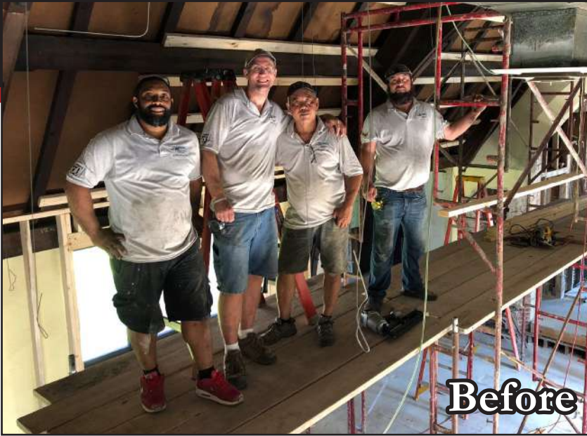
All Among Us - Agape Carpenters framing around existing rafters in sanctuary