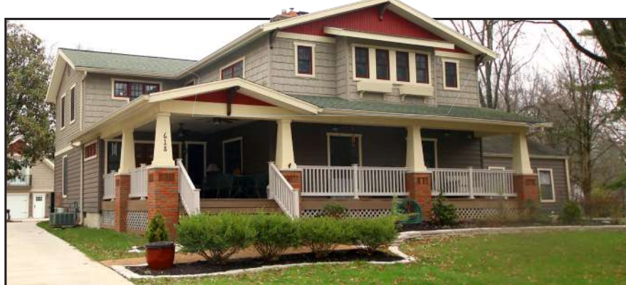
Garage’s colors and architecture match elements of the Original Home. Agape expanded & remodeled the home in 2006 and updated the interior in 2014.