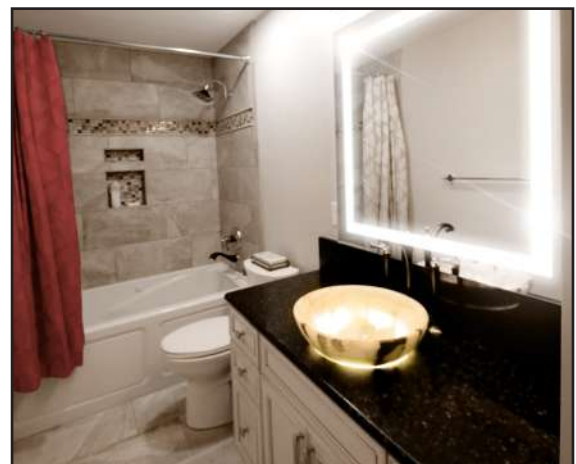
Updated Bathroom also features Glowing Sinkbowl

Celebrating 33 years of making our clients' dreams a reality.