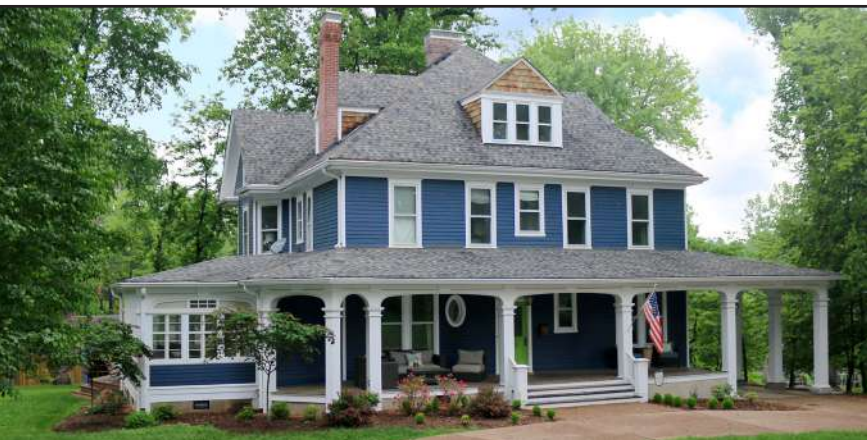
Historic Front Elevation of Original Home - Built in 1907