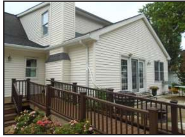
Glencoe Back Porch Addition