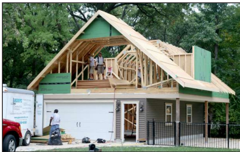
Skilled Agape Carpenters framing out the New Addition

Clearly the garage’s colors and architectural features match elements of the original home. Historically-accurate brackets are expertly duplicated from the main house to the garage. The pop of red in the gable and trim, the cream colored band board, and the green roof clearly echo the home’s facade. This hidden gem adds character to its surrounding Kirkwood neighborhood.