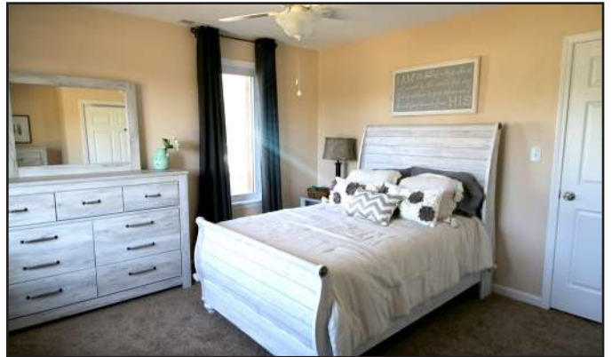
Hannah’s Ranch - One of several rooms furnished by Agape