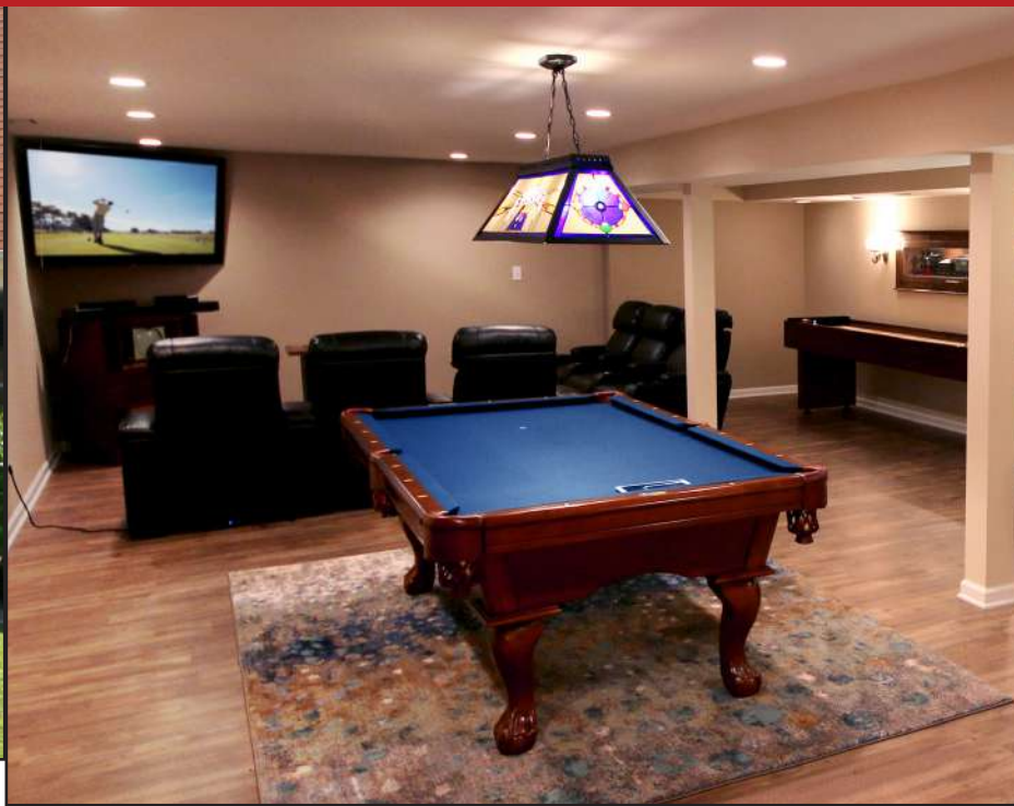
The Basement's Open Floor Plan ties together many Entertaining Elements