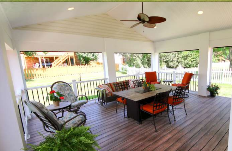
Stunning Covered Deck features low-maintenance Zuri wood flooring and is surrounded by Retractable Screens to keep out Natural Elements