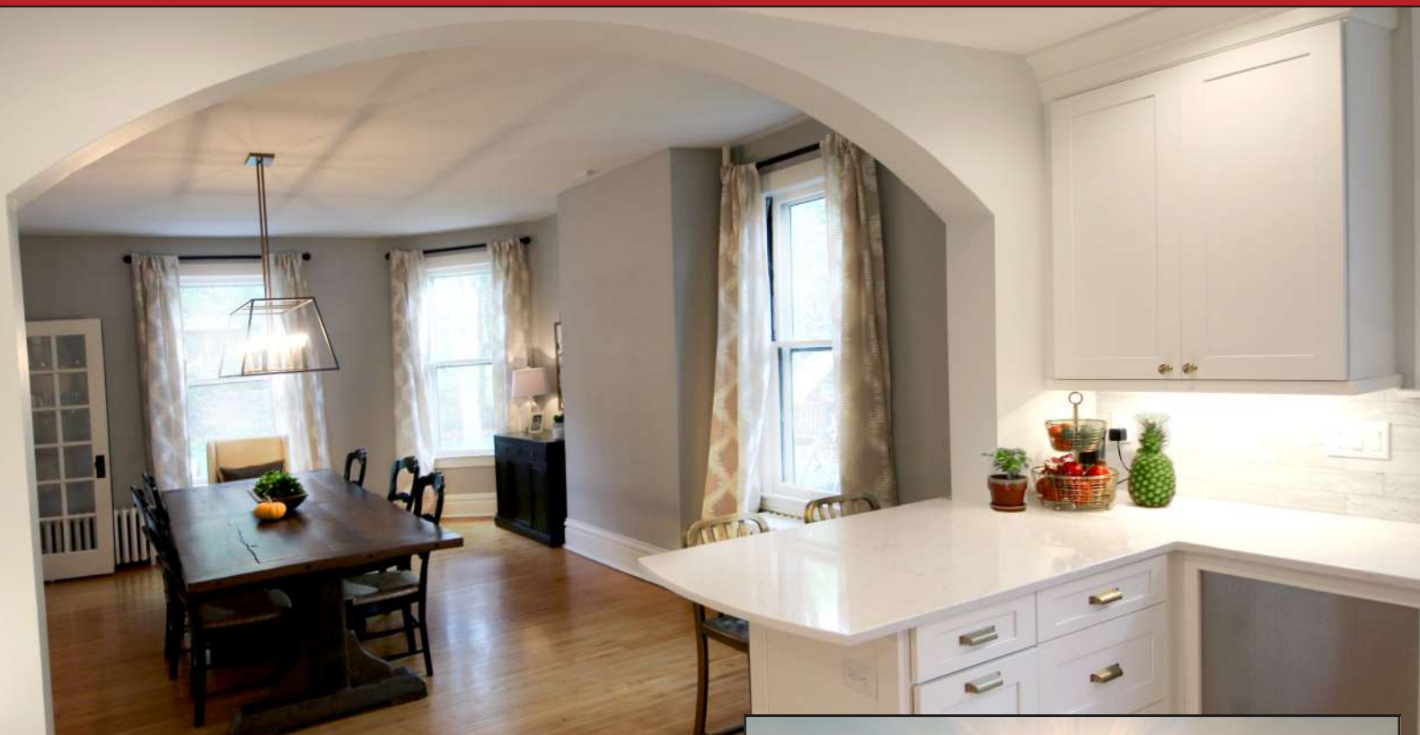
Large Archway seamlessly hides transition between Dining and Kitchen ceilings